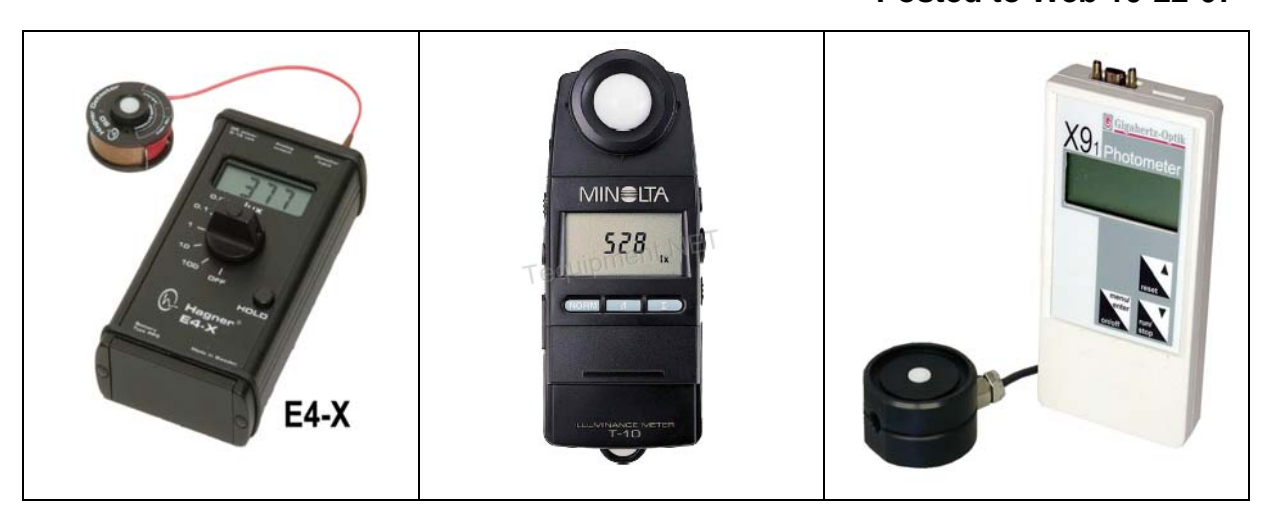
Figure C1. Typical meters for illuminance measurements